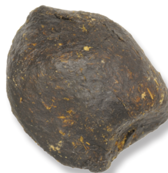
The dung dupe

VIDEO: Watch camera-trap footage of the small mammal R. pumilio dehusking Ceratocaryum nuts.